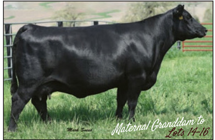
S A V MADAME PRIDE 1282: Dam of T Bar T donor dam, Janssen Madame Pride 4514, and maternal granddam to flush brothers & lots 14-16.

Flush brother by Insight out of our proven donor cow, Janssen Madame Pride 4514. To add pounds to your calf crop and good looks — don't overlook these bulls!